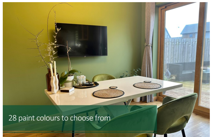
28 paint colours to choose from