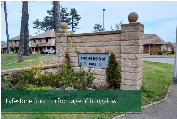
Fyfestone finish to frontage of bungalow