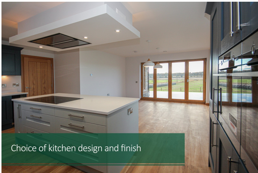
Choice of kitchen design and finish

Disclaimer: Since the property is not complete, images are from similar house types and a representation of what the finished product could look like.