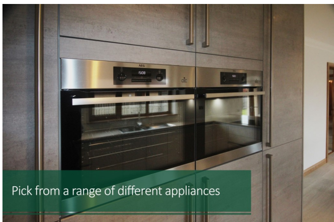
Pick from a range of different appliances